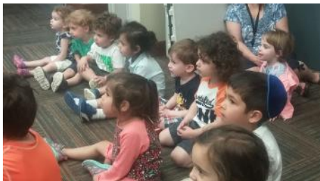
Watching the fire safety puppet show